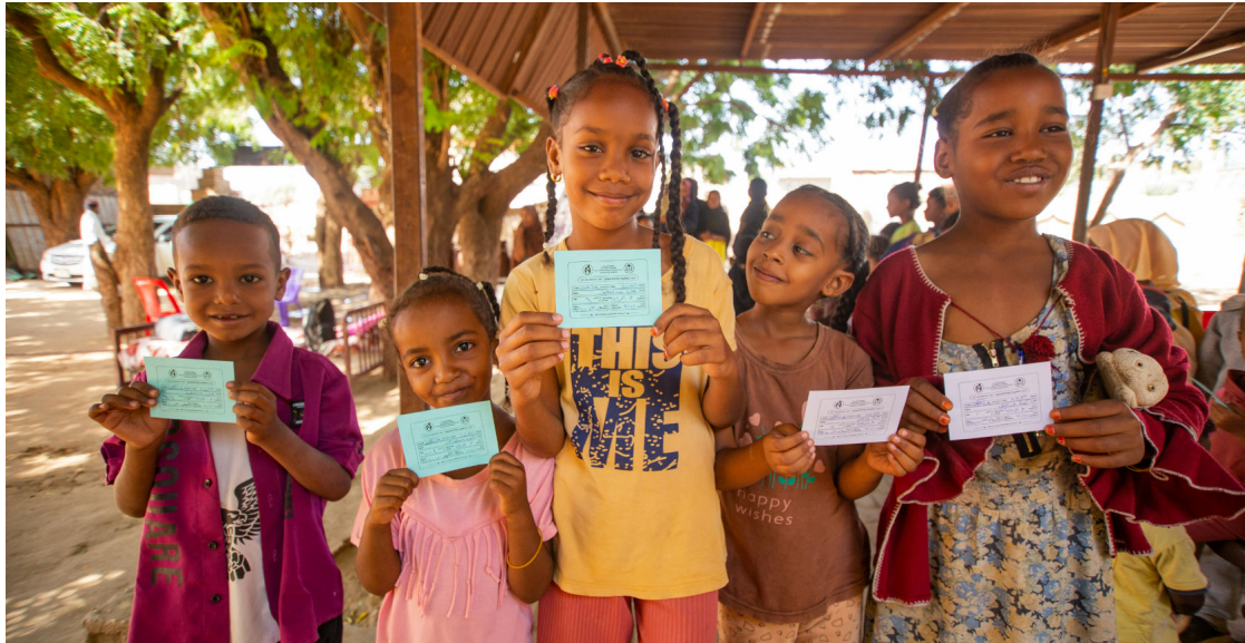
On 21 November 2023, children display vaccination cards after receiving doses of cholera vaccine during a cholera vaccination campaign in Madani, Gezira State.